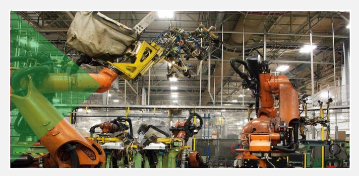
Manufacturing: Unified Stream processing and IoT analytics to more effectively predict issues.