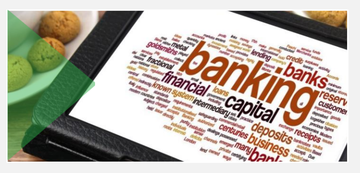
Banking and Finance: Fraud detection, risk analysis, sales predictions, and compliance enhanced through real-time and historical analytics of operations and client data.