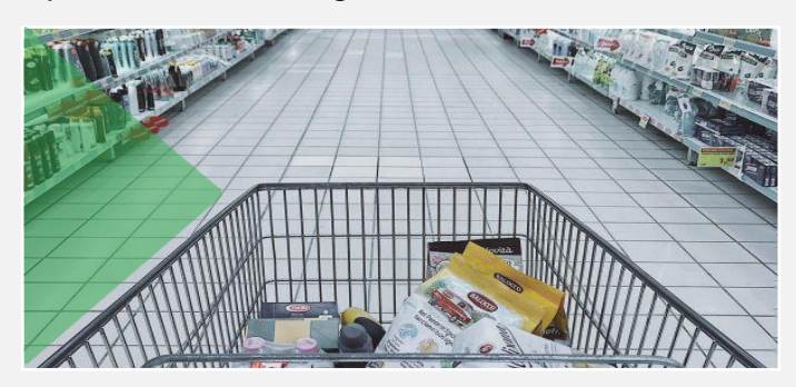
Retail: Comprehensive analytics for personalization, marketing automation, demand forecasting, and supply chain optimization.